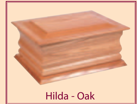
Hilda - Oak