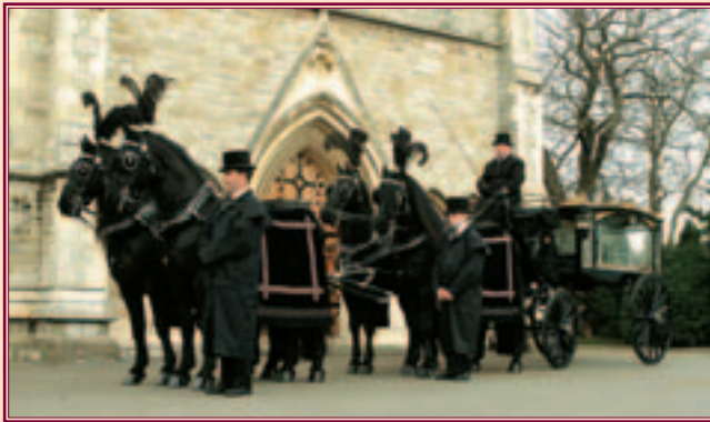
Horse Drawn Carriages