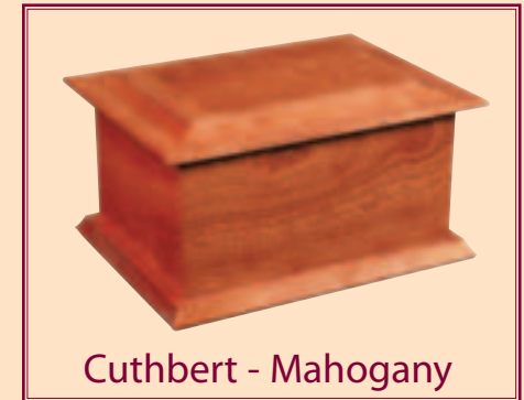
Cuthbert - Mahogany