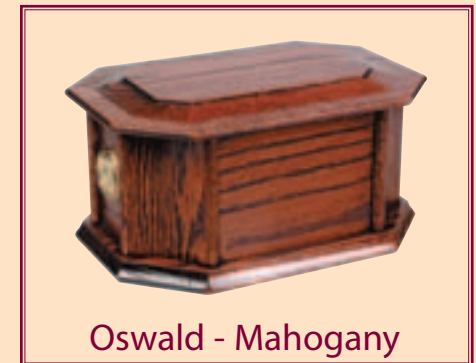
Oswald - Mahogany