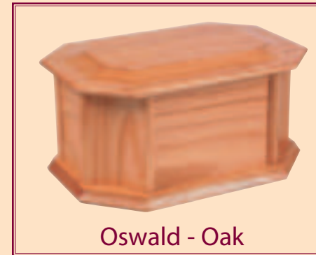
Oswald - Oak

Regional variations on vehicle types may apply.