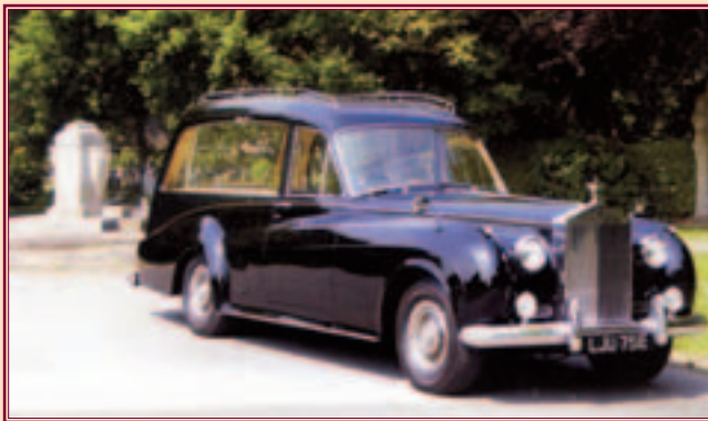
Vintage Rolls Royce Hearse